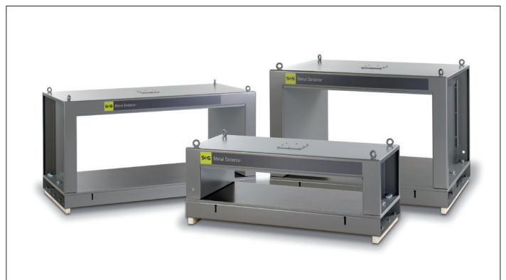
The passage openings of the DLS metal detectors are matched to the respective application.