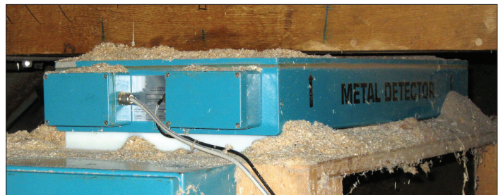
ELS metal detector for chipper & hog protection